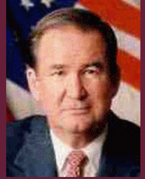
Patrick J. Buchanan

Mr. Buchanan is a political commentator, magazine editor, book author, television personality, and three-time candidate for President of the United States.