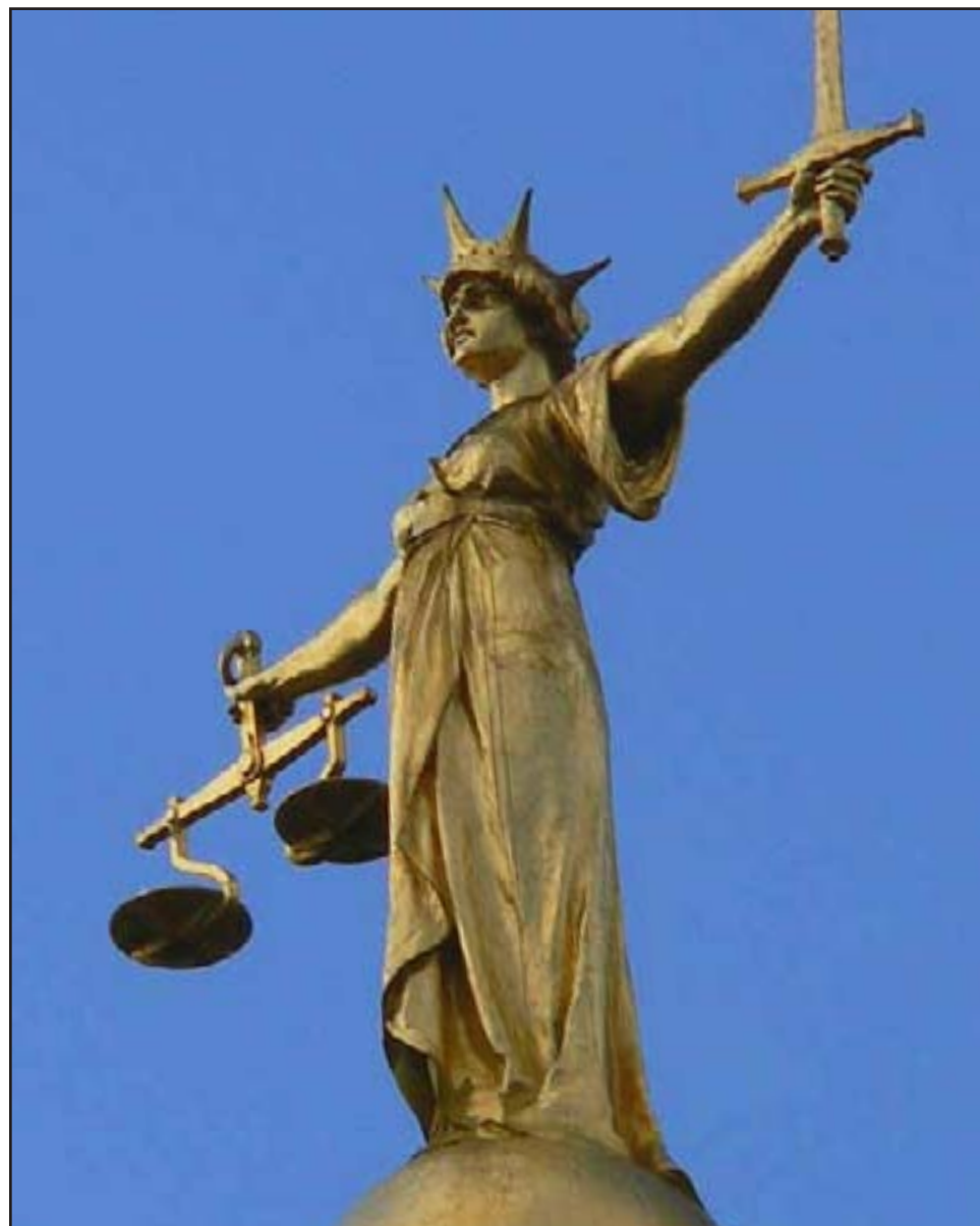
Lady Justice standing atop the Old Bailey courthouse in London. Modern hate-crime legislation will overturn 800 years of western concepts of jurisprudence in the punishment of criminal conduct.