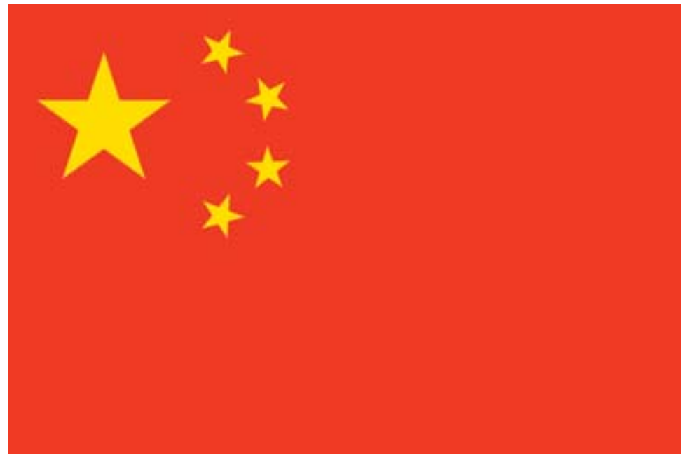
The Red Chinese flag of the Chinese Communist Party, the largest terrorist organization in the world with which the United States has diplomatic and trade relations.

In the event that China attacks Taiwan, the U.S. (due to neglect of the Chinese threat) would be left with a tough decision. Do we send forces in to protect Taiwan and face the "nuclear option" of China crashing the dollar and sending the world into a depression, or do we sit on the side-