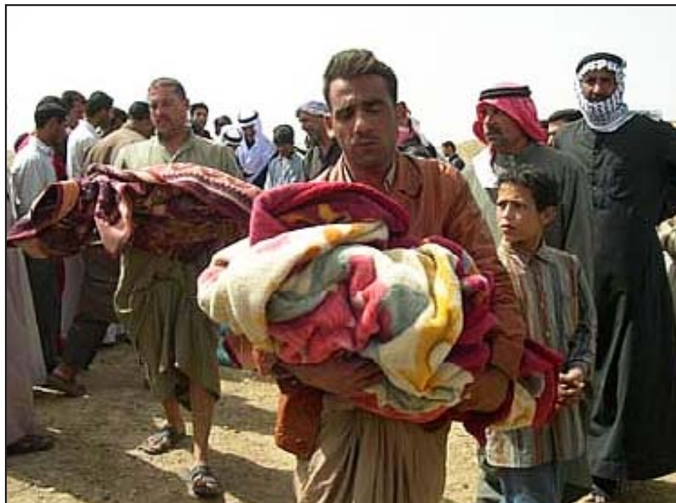
Locals carry the victims of the Alsafta massacre from the rubble.

This is underscored by CBS News reporter Lara Logan's uncovering of how death squads