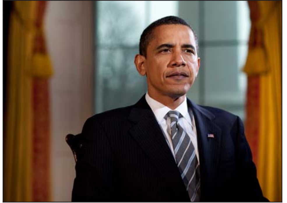
Within 48 hours of taking office, President Obama authorized taxpayer money to pay for the murder of helpless innocents.

Even if somebody is not 100 percent certain that the fetus should be considered a living human, the mere possibility that this is true should give one serious reason to question the legitimacy of abortion. However, many people try to push this possibility out of their minds, even though it seems to float just below the sur-