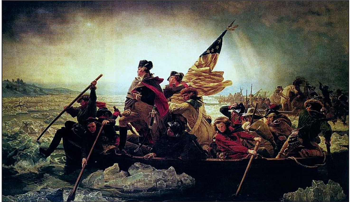
“Washington Crossing the Delaware” oil-on-canvas painting by Emanuel Leutze (1850). With brave daring, General George Washington crossed the Delaware River on Christmas Day, 1776, in a surprise move against the Hessian forces at Trenton, New Jersey.