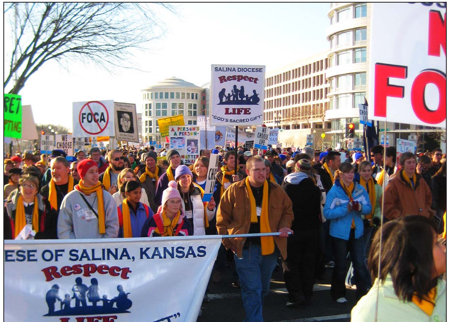
On January 22, 2009, the annual March for Life took place in our nation's capitol, drawing an estimated 250,000 supporters. The gathering received almost no coverage in the national press.

Supporters of the bill, including the National Abortion Rights Action League (NARAL), claim that the bill would not allow taxpayer funding of abortion or require hospitals and doctors to provide abortion services in violation of their convictions. However, pro-life organizations see such