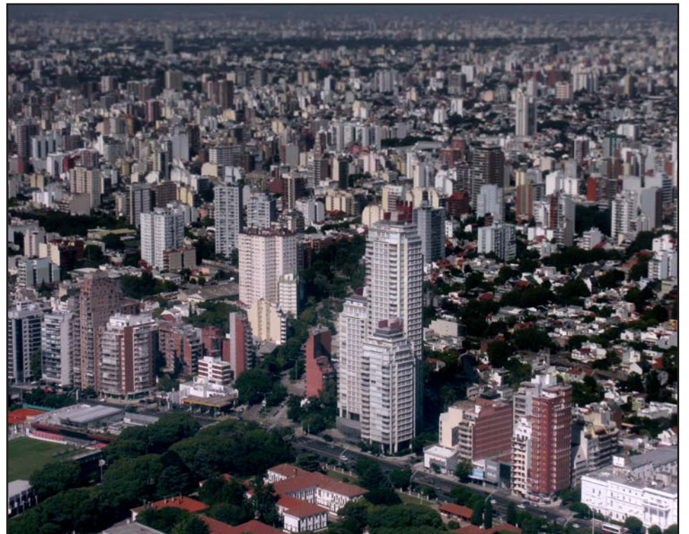
Downtown Buenos Aires, Argentina.