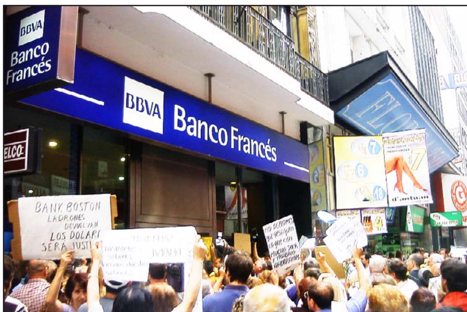
Argentina citizens protest the freezing of bank accounts and forcible conversion of their dollar holdings to devalued Pesos.