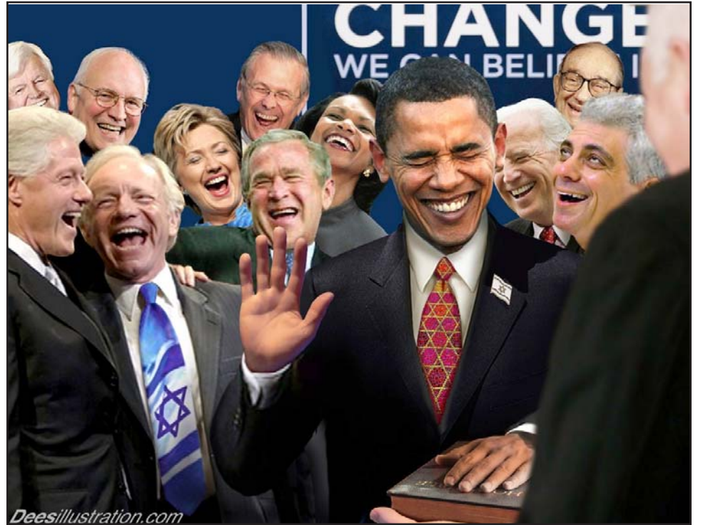
Deesillustration.com "Preserve, protect and defend the WHAT????!!!"