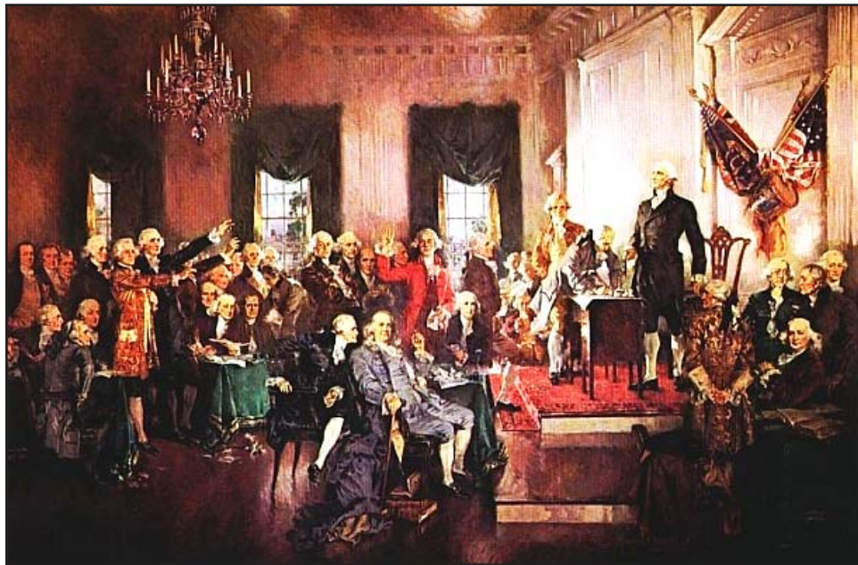
“Scene at the Signing of the Constitution of the United States”