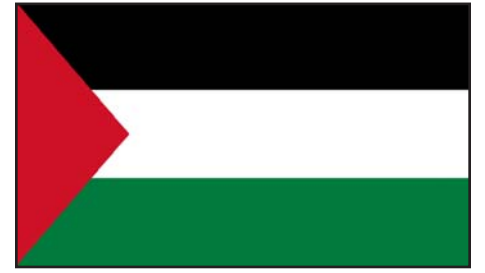
Israeli flag (left) and Palestinian flag (right)

overthrow of the Iranian government. But Iran has responded mildly to our removal of their elected government. The seizure of hostages in 1979 was little more than a pinprick.