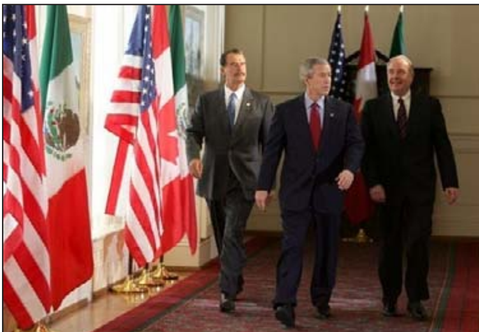
March 2005 -- President Bush walks with Mexican President Fox, left, and Canadian Prime Minister Paul Martin at the Waco, Texas summit at which the Security and Prosperity Partnership was inaugurated.