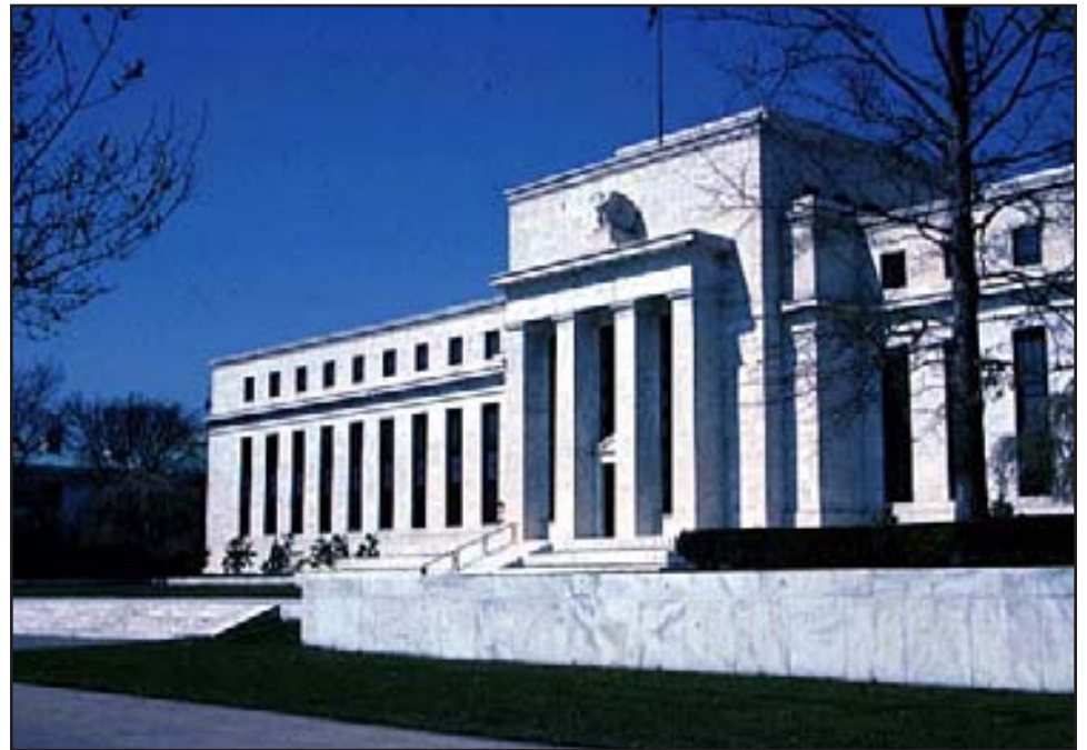
The Marriner S. Eccles Federal Reserve Board Building, on Constitution Avenue between 20th and 21st Streets, NW, designed by Paul Phillippe Cret and completed in 1937.