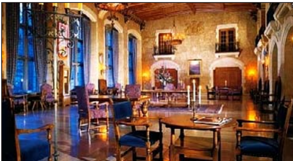
Interior of the Banff Springs Hotel

It is time to be proactive, and it is a major mistake to wait for someone else to lead the way. So please start by calling your congressmen, requesting an AFP membership form, and by contributing what you responsibly can to support our outreach efforts.