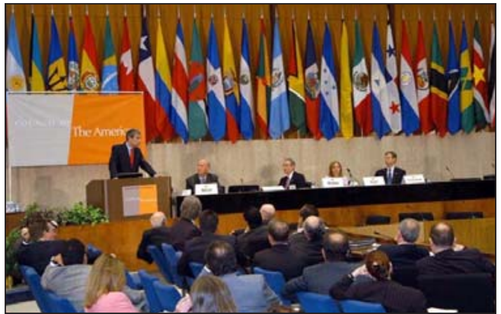
Secretary of Commerce Gutierrez addressing the Council of the Americas -- mother organization for the North American Competitiveness Council

In carrying out your instructions, we established working groups under both agendas of the Partnership - Security and Prosperity. We held roundtables with stake holders, meetings with business groups and briefing sessions with legislatures,