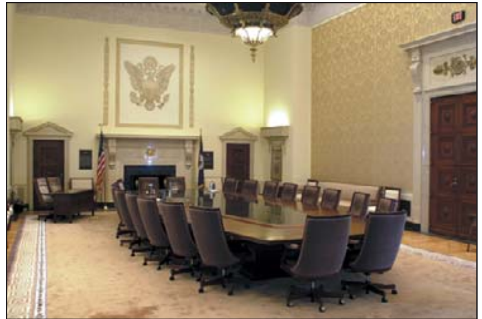
Board Room where the Federal Reserve Board Members meet.

The controversy regarding the CPI is extremely important to all Americans. As was already shown, understanding what the true inflation rate is is critically important to one's retirement planning. Additionally, many private sector wage contracts and pensions are indexed to the CPI, so statistical shenanigans can rip off workers and retirees in many ways.