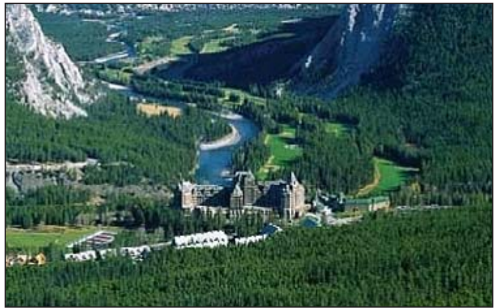
An outside view of the remotely situated Fairmont Banff Springs Resort, in Alberta, Canada, where the North American Forum was held under a media blackout.

The Center for Strategic and International Studies (CSIS) is yet another think tank which works to advance this cause, and has been since at least 1985. In 1985, its working group on U.S.-Canadian Relations produced a report