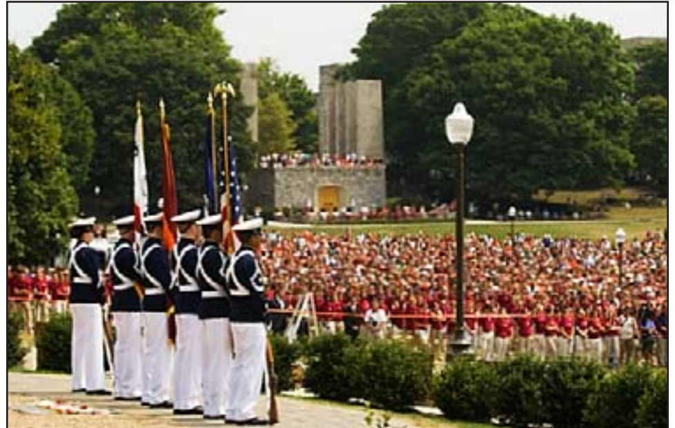
An honor guard presents the flags at the Memorial Dedication Ceremony held Sunday, August 19, 2007 in memory of the victims of the Virginia Tech massacre.

even under the Clinton Administration. She made false statements about crime statistics to whip the anti-gun lobby into a frenzy and frighten the average citizen. This is a commonly used tactic among left-leaning politicians opposing the Constitution, whether it be for gun control or regulation of free speech.