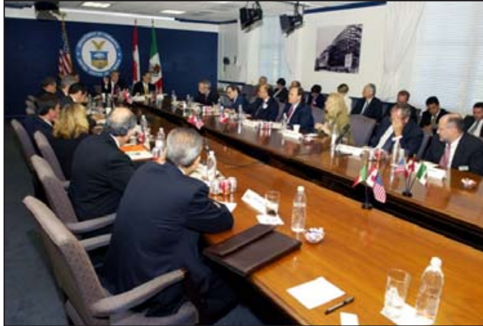
Secretary of Commerce Gutierrez addressing the North American Competitiveness Council

A similar culture of attachment to independence still exists in Great Britain, where the outgoing Prime Minister Tony Blair "welcomed controversial plans to bring back the troubled EU constitution by the back door - totally bypassing the need for public referendums on sweeping new powers for Brussels", according to the Daily Express. The Express goes on to mention that, "German chancellor Angela Merkel has suggested ditching the name 'constitu-